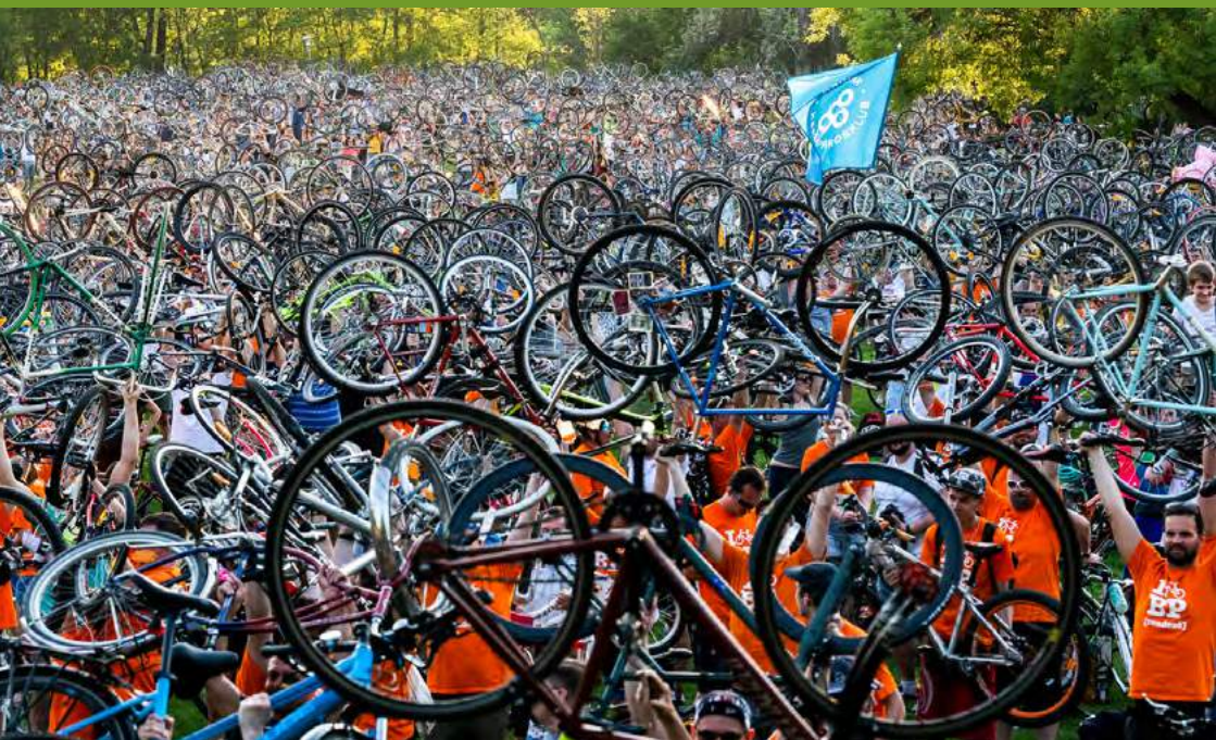
Hungarian Cyclists' Club