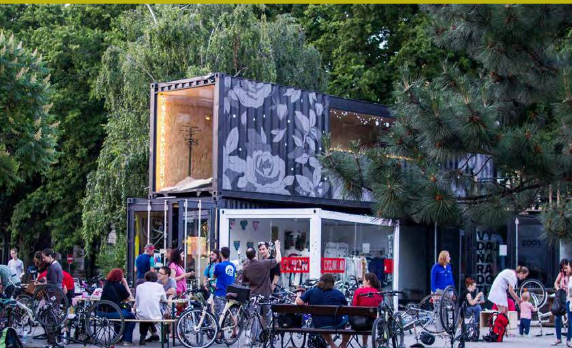
Cyklo Kuchyna, Bratislava