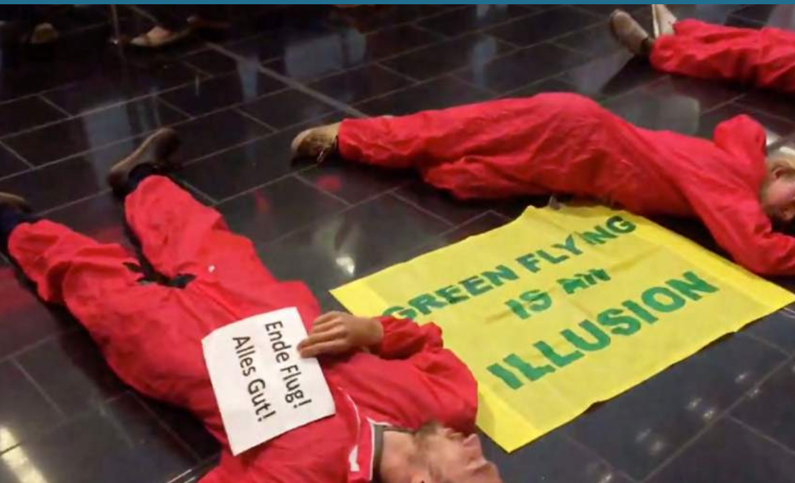
System Change, not Climate Change!